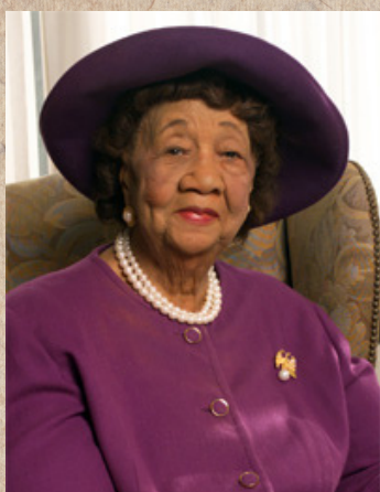
DOROTHY HEIGHT (1912-2010)